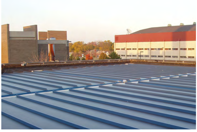
University of Detroit-Mercy (10kW) Detroit, MI