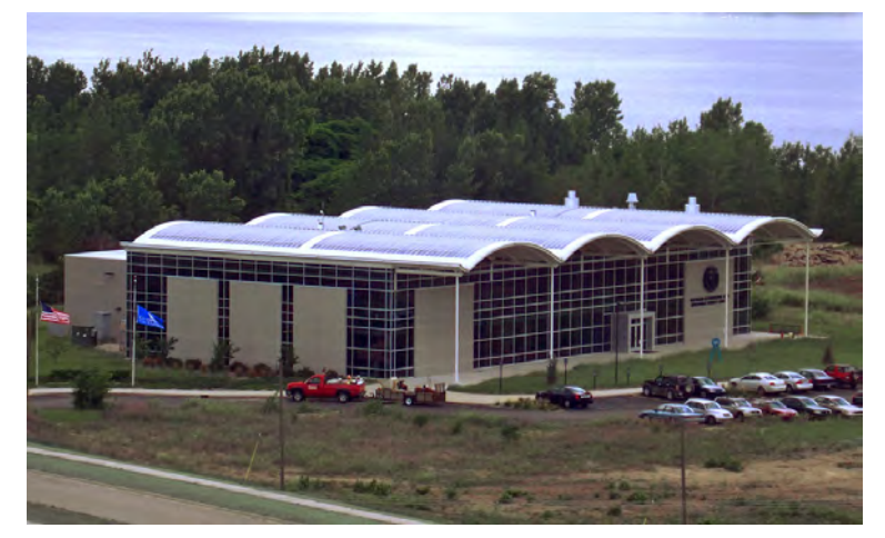
Michigan Alternative and Renewable Energy Center (30kW) Grand Valley State University, Muskegon, MI

Call 1.800.528.0617 or visit us at www.uni-solar.com